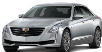
Radiant Silver Metallic