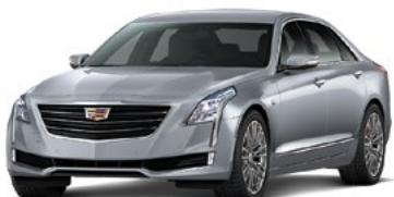
Satin Steel Metallic