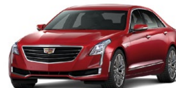
Red Horizon Tintcoat