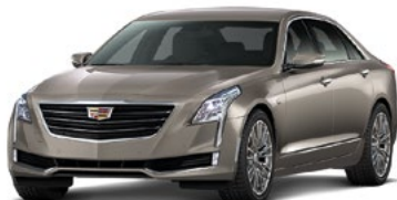
Bronze Dune Metallic