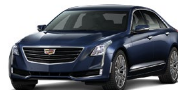
Dark Adriatic Blue Metallic