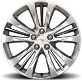
20" x 8,5" ultra-bright, machined-face aluminum, multi-spoke with Manoogian Silver pockets