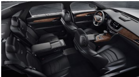
Jet Black semi-aniline full-leather seats, chevron-perforated inserts with Jet Black dashboard accents and Choco Noir high-gloss Sapele wood trim/high-gloss Bronze carbon-fiber trim