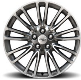
20" x 8,5", 5-split-spoke aluminum wheels with Manoogian Silver premium-painted finish and 5 chrome inserts