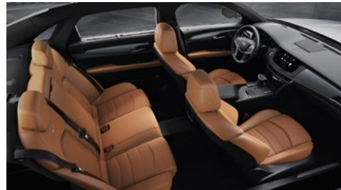
Cinnamon leather seating surfaces, chevron-perforated inserts with Jet Black dashboard accents and high-gloss Twill Weave carbon-fiber trim/Piano Black trim