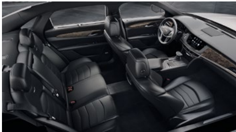
Jet Black leather seating surfaces, chevron-perforated inserts with Jet Black dashboard accents and high-gloss Mineral Poplar Burl wood trim/high-gloss Bronze carbon-fiber trim