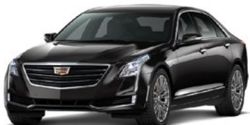
Stellar Black Metallic