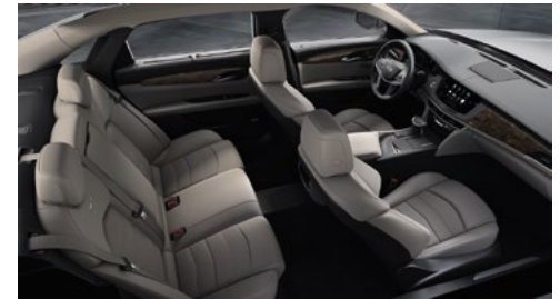
Light Platinum leather seating surfaces, chevron-perforated inserts with Jet Black dashboard accents and high-gloss Mineral Poplar Burl wood trim/high-gloss Bronze carbon-fiber trim