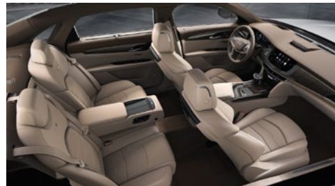
Very Light Cashmere semi-aniline full-leather seats, chevron-perforated inserts with Maple Sugar dashboard accents and high-gloss Cafe Noir Eucalyptus wood trim/high-gloss Cafe au Lait Eucalyptus wood trim