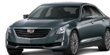
Stone Gray Metallic