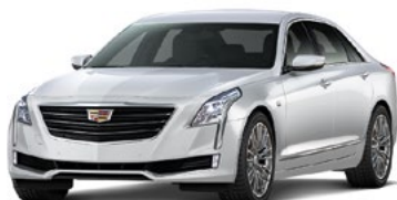
Crystal White Tricoat